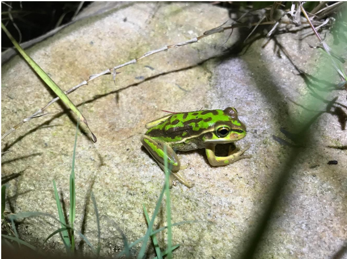
Figure 2: Photograph of GGBF at Enhancement Area Pond 3.

Data from the frog surveys are provided in Appendix 2.